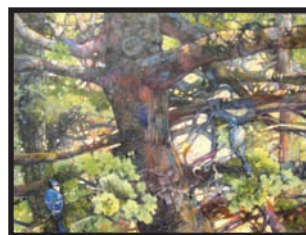
Second Place "Border Dispute" by Shari Hornish

"Border Dispute" stood out because of its exceptional composition of subtly "poetic" colors that just happened to be recognized as natural shapes. The handling of the oil paint strokes expressed the best qualities of the medium.