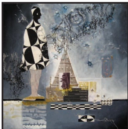
Best of Show "Time Traveler" by Jane C. Stephenson

There were many high quality works in the show. The collage "Time Traveler" was such a magnificent composition of shapes, lines, patterns, subtle values and monochrome colors that it loomed large above all other works. It met all my criteria for composition, expressive qualities, originality and handling of the medium.