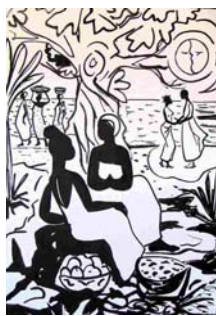
"Under the Big Tree" by Celine Raphael - Leygues

"Drama in Black and White" was an unusual exhibition featuring 62 pieces of artwork from 40 TVAA artists. The theme for this show is to display work that is primarily black and white with some added color for accent. Media included photography, pencil, ink, charcoal, oil, acrylic and digital works.