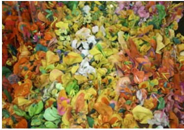
Best of Show Kelli Howie for "Patsy's Garden," Synthetic Clay